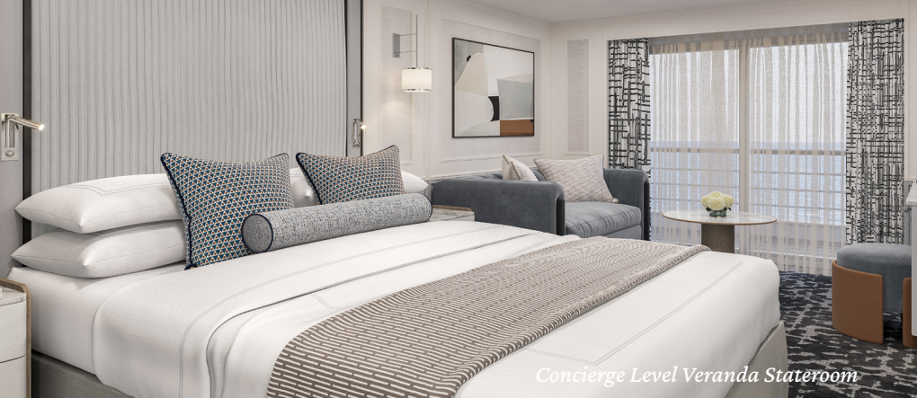
Concierge Level Veranda Stateroom