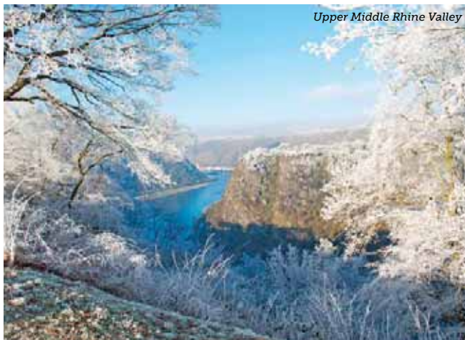
Upper Middle Rhine Valley